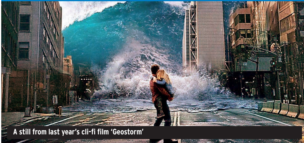
A still from last year's cli-fi film 'Geostorm'